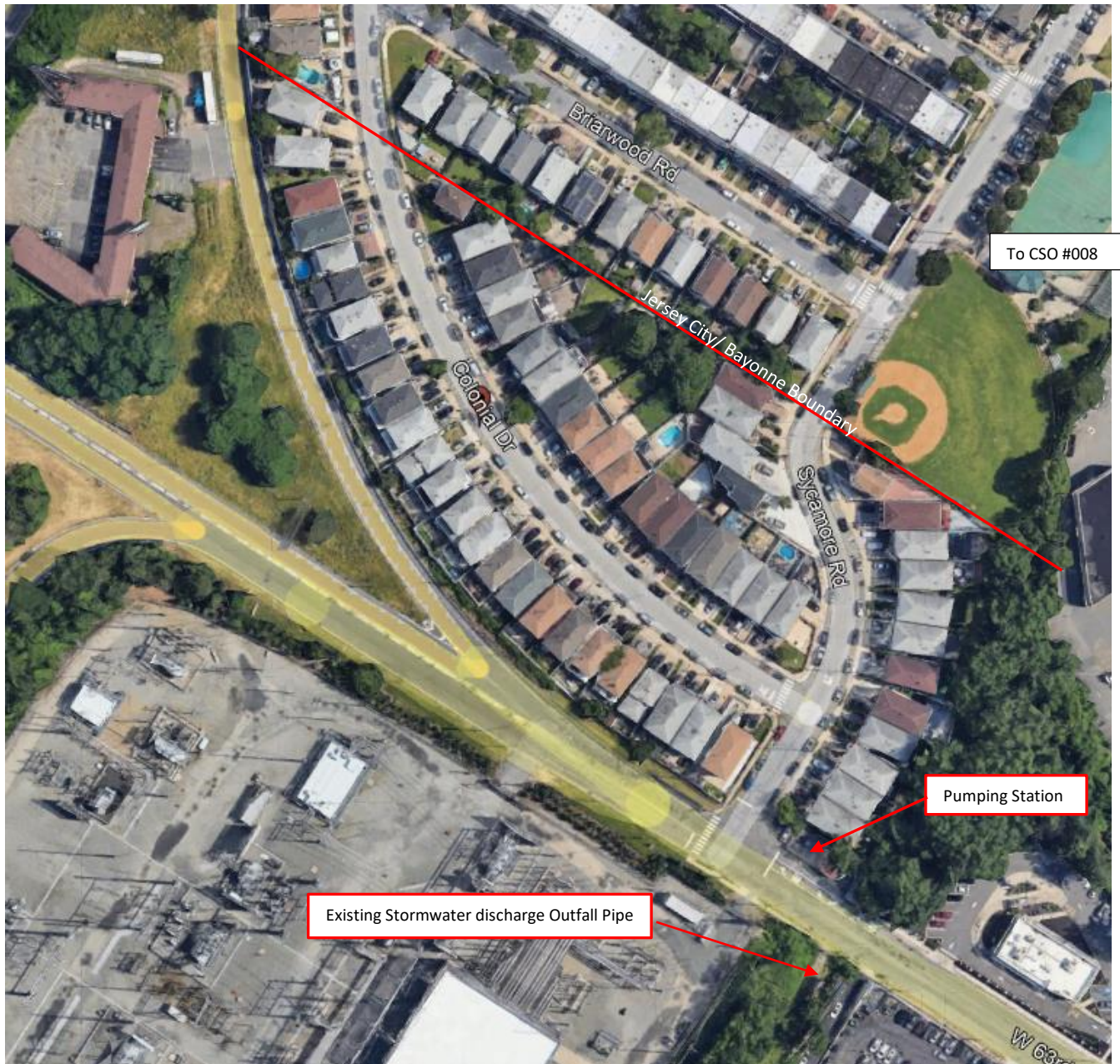
Figure 2 – Site Locations

According to record drawings, the existing 36" diameter R.C. outfall pipe, installed at a flat gradient, discharged directly into the drainage ditch and the outfall pipe end was not protected by an outfall structure with flap valve nor were any check valves installed on the stormwater discharge pipework to prevent stormwater backflowing into the stormwater wet well during heavy storms. The lack of an outfall structure also contributed to the stone and soil materials collapsing around and into the outfall pipe.