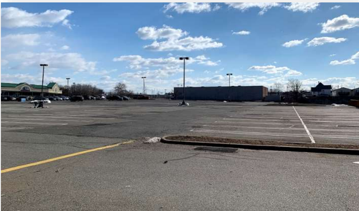
Figure 4 – view of vacant and severely underutilized former A&P parking lot (3/3/19)