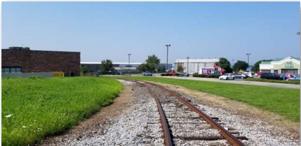
Figure 8 View of rail spur looking south, with subject Bayview site on right prior to A&P demolition (8/28/2018)