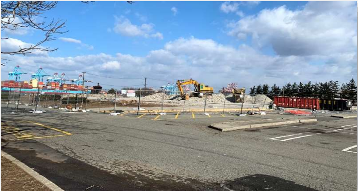
Figure 3 – view of former A&P building being demolished and reduced to rubble, looking west toward the marine port (3/3/19)