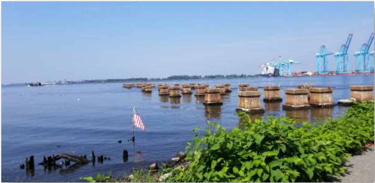
Figure 9 – View of site waterfront (8/28/18)