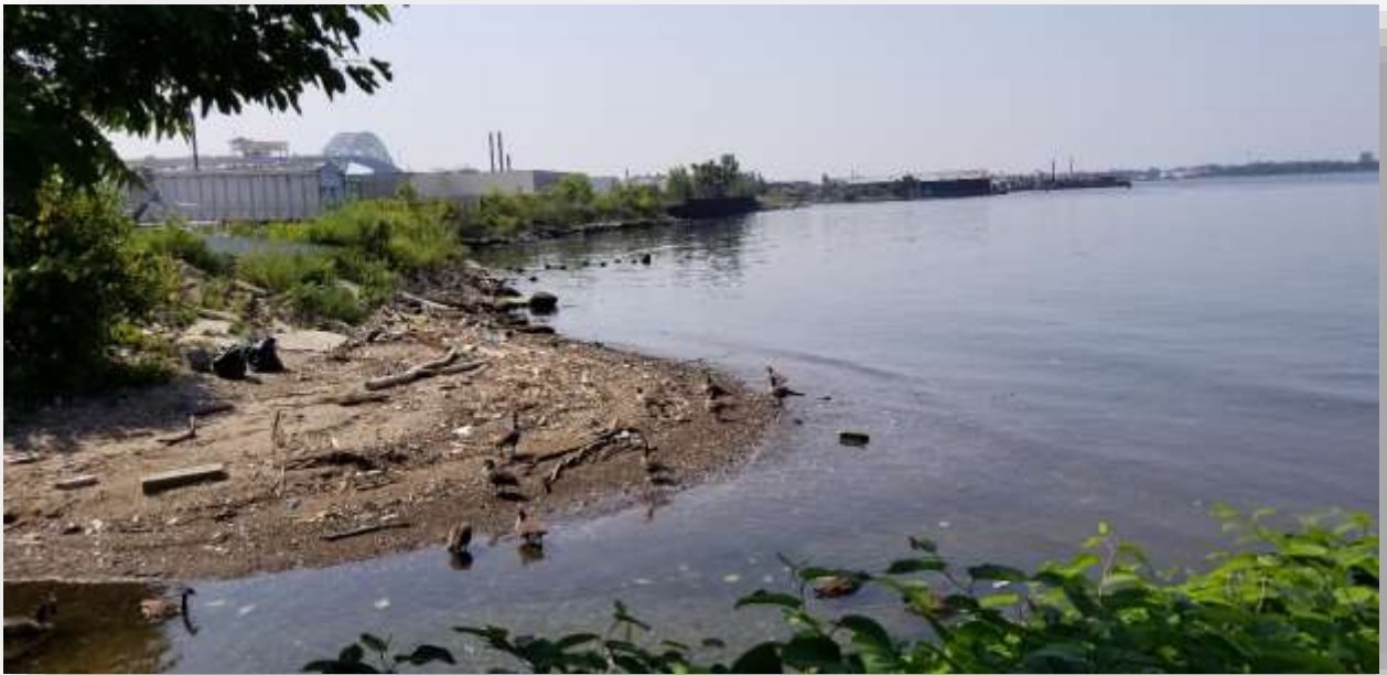
Figure 12 – View of site waterfront (8/28/18)