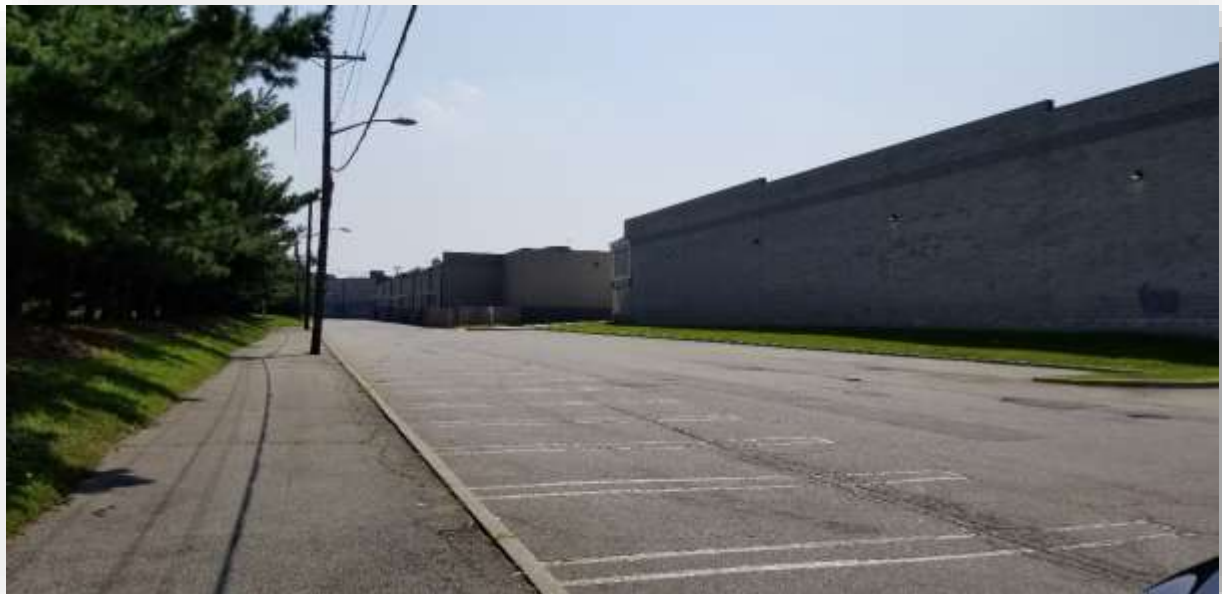
Figure 2 - View of the rear of the building in Figure 1 above looking east toward Avenue A (3/3/19)