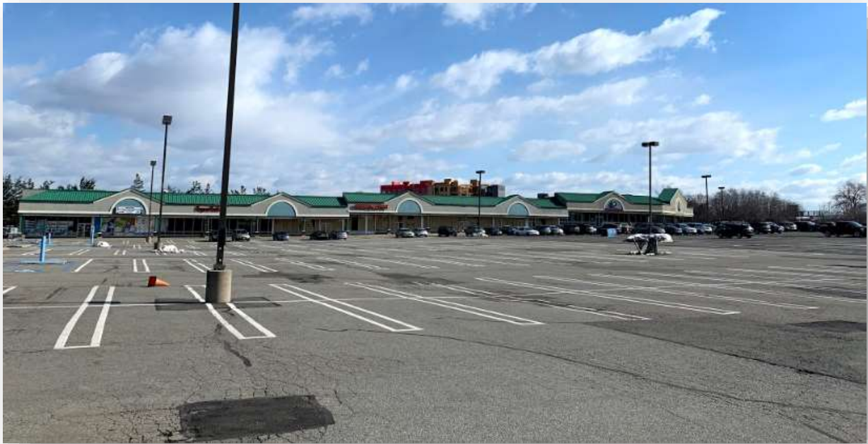
Figure 1 - View of front of onsite building looking north from parking lot (photo taken 3/3/19)