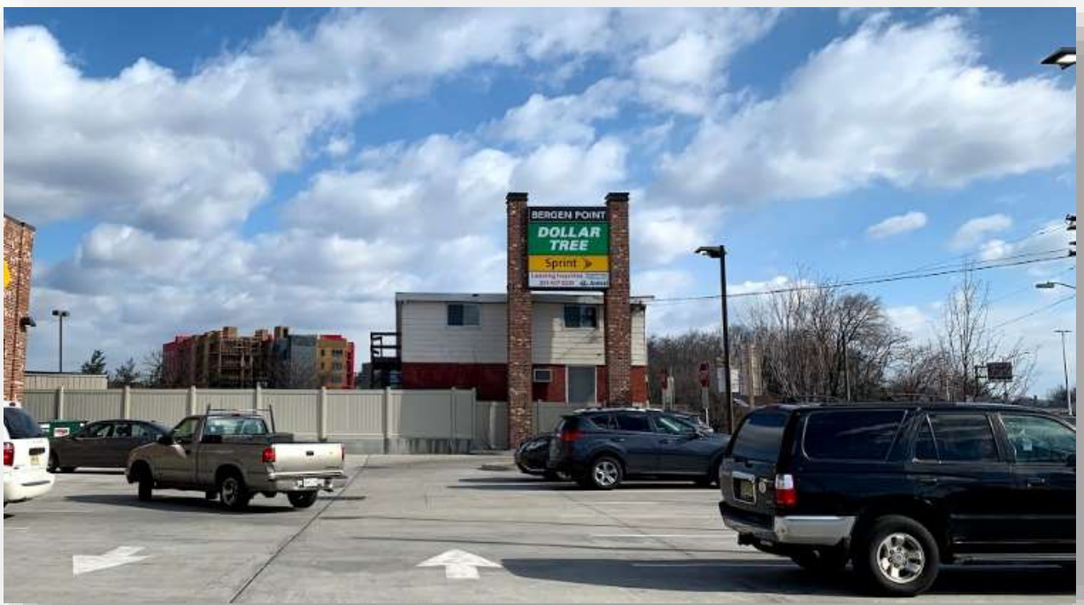
Figure 6 - view of building on Lot 2 from adjacent lot, looking north (3/3/19)