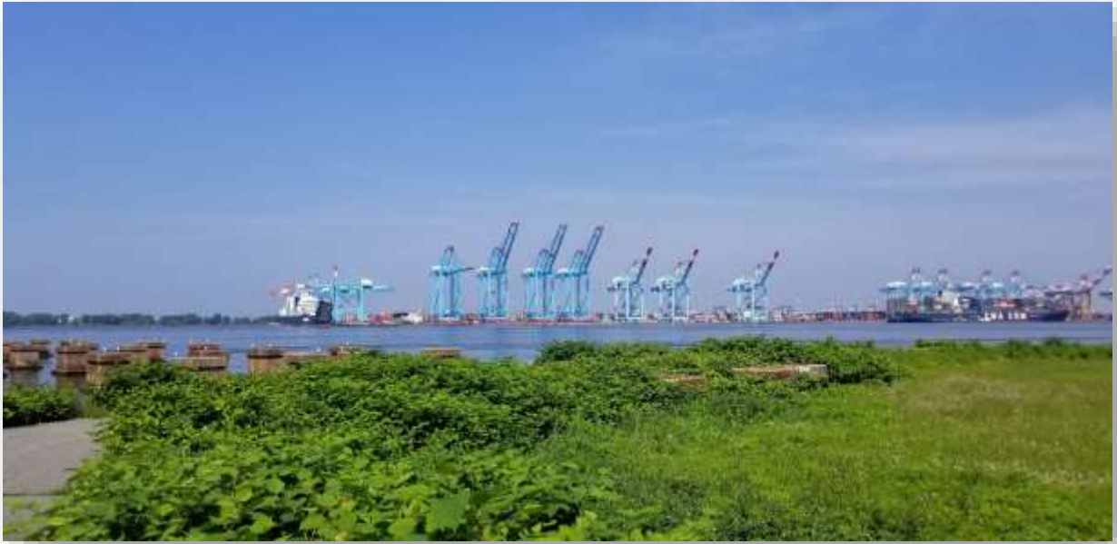
Figure 11 – View of site waterfront (8/28/18)