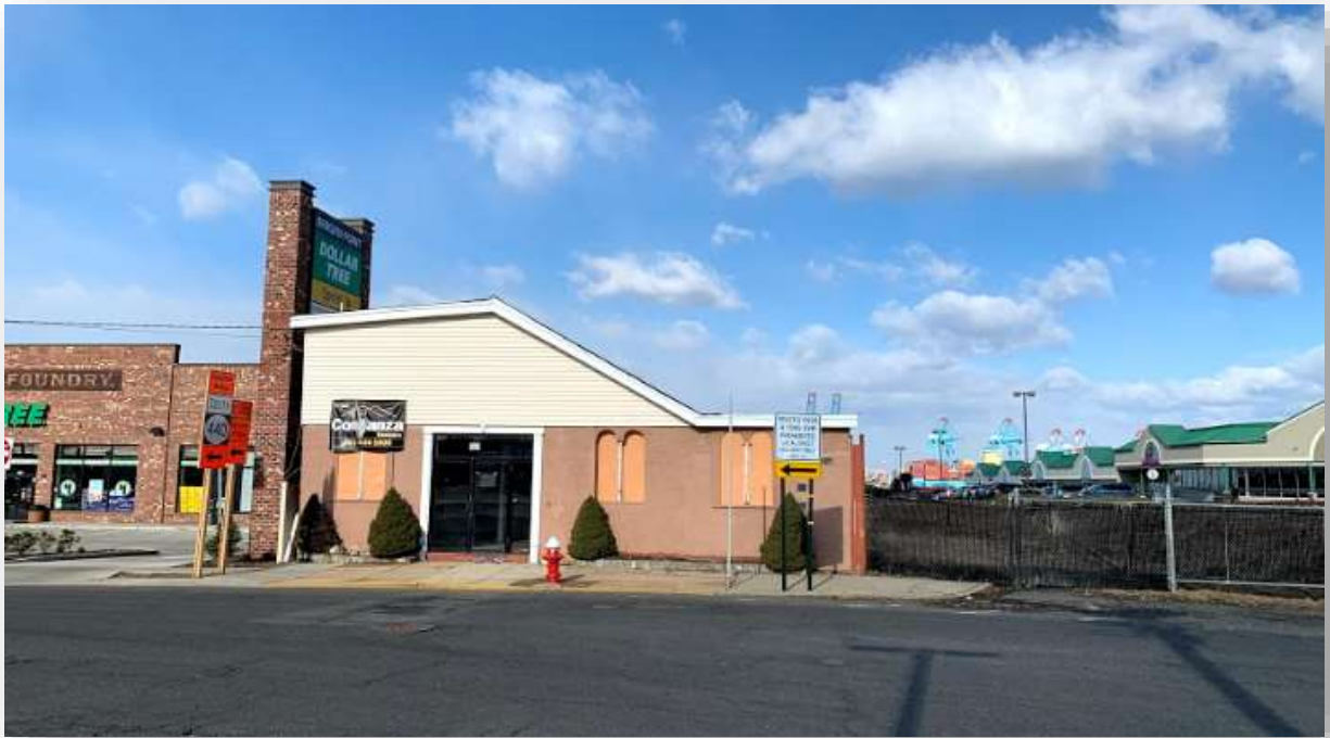
Figure 5 – view of building on Lot 2 from Avenue A (3/3/19)