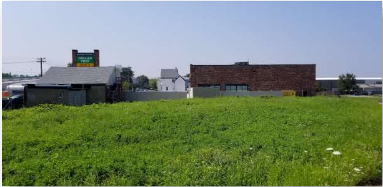
Figure 7 – View of subject site looking south toward vacant building on Lot 2 and Dollar Tree building beyond that (8/28/18)