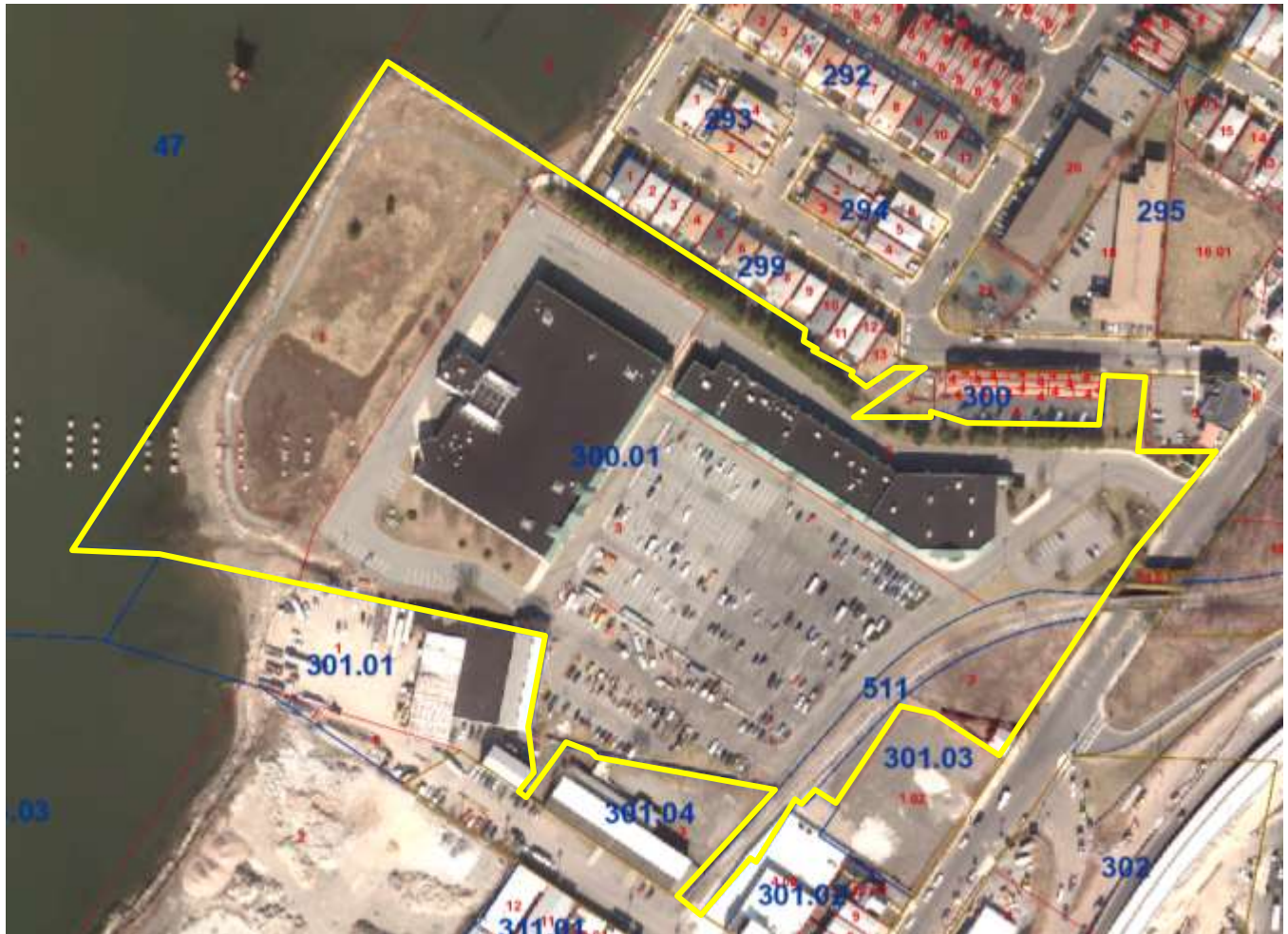
MAP # 2 ~ AERIAL PHOTO