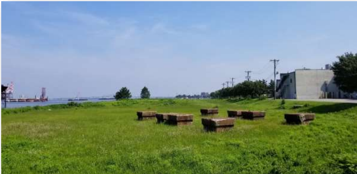
Figure 10– View of site waterfront (8/28/18)