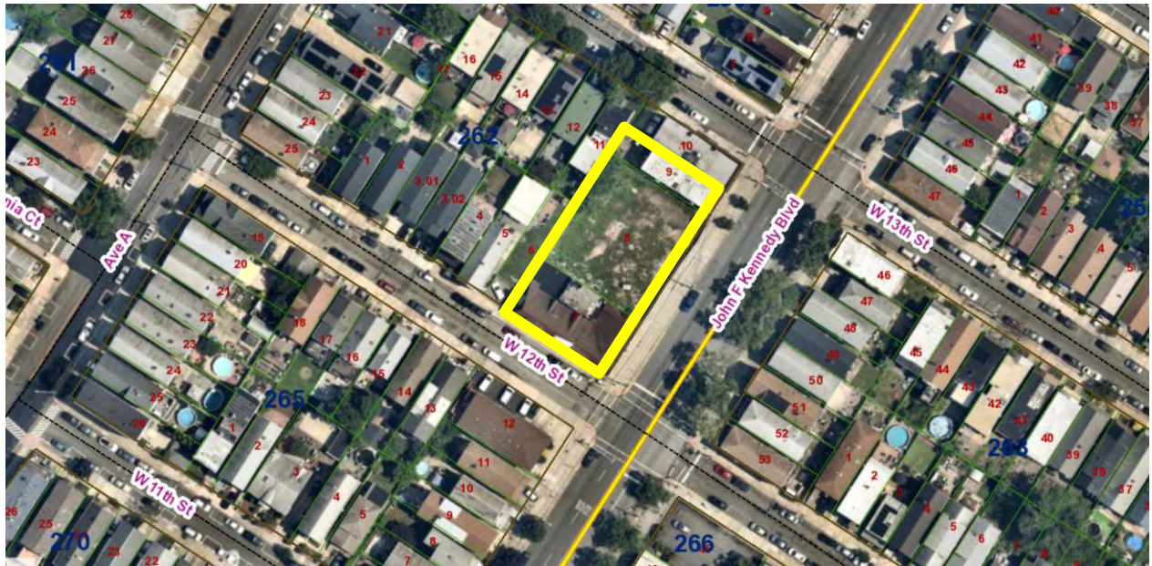
Figure 2 – Aerial Photo