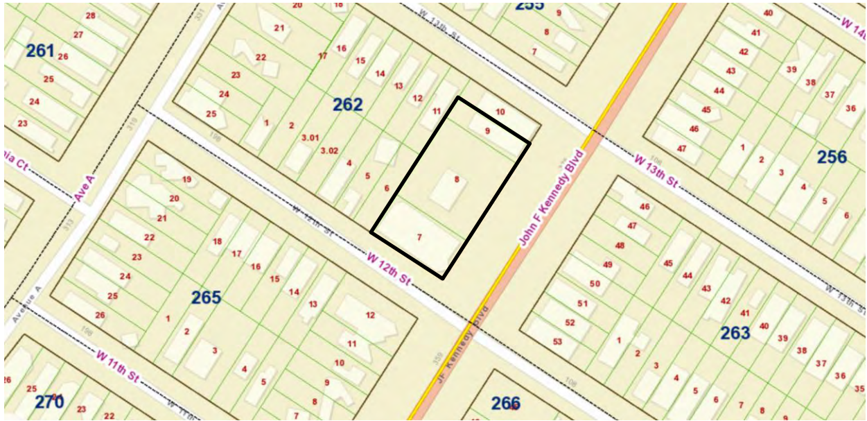
Figure 1 – Parcel Map