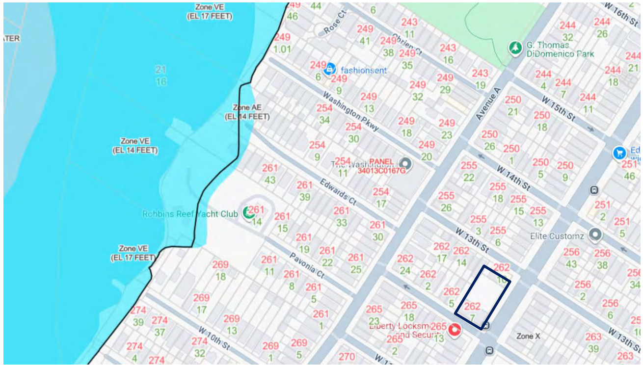
Figure 3 – Flood Map