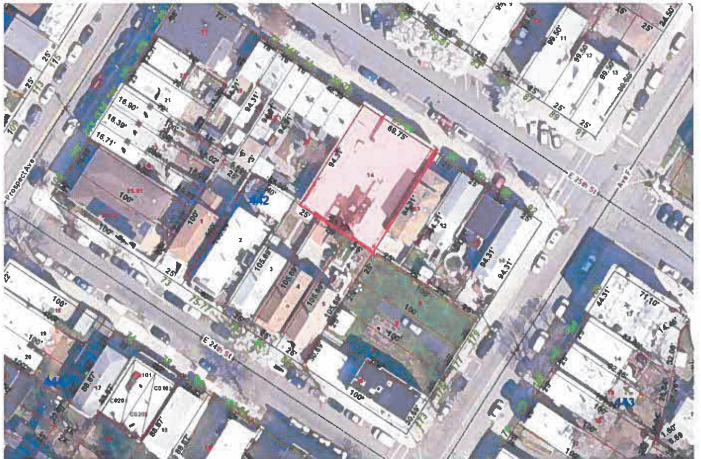
Figure 2 – Aerial Photo